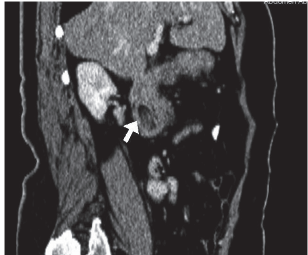
Figure 3. Axial, coronal and sagittal abdominal computed tomography scan showed duodenal mass in the second part of the duodenum (white arrows)