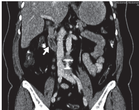
Figure 2. Axial, coronal and sagittal abdominal computed tomography scan showed duodenal mass in the second part of the duodenum (white arrows)